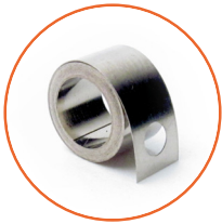
Constant Force Spring